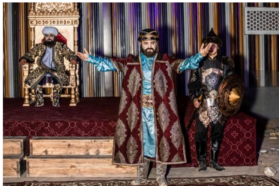
Figure 4. Bukhara

In particular, in Bukhara, in the Ark, an episode of the reception of foreign ambassadors by the emir was staged. (Fig. 4) This production reflects the actions that took place here a little more than a century ago! But this is not enough, the idea must be developed. And the creation of theme parks should be one of the ways to achieve this goal. In the capital of Uzbekistan, you can visit the Victory Park, the Alley of Writers or the Ecopark, in the Bukhara region, ride camels or horses in the new tourist cluster "Bukhara Desert Oasis & Spa" or take a walk through the huge park "Valley of Legends" in Namangan. (Fig. 5-6-7).