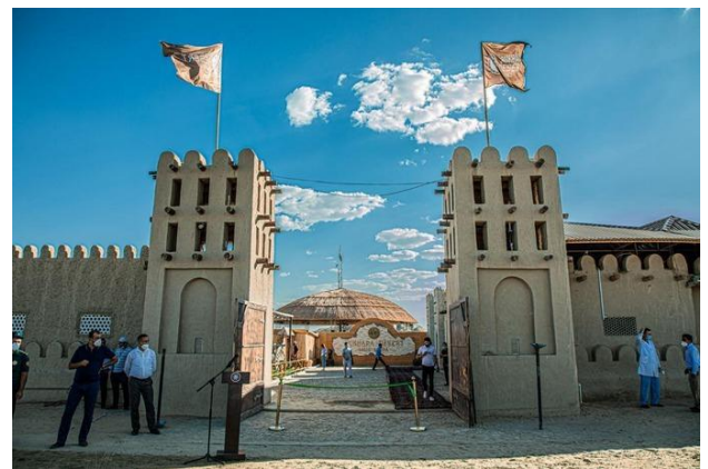
Figure 6. Bukhara Desert Oasis & Spa