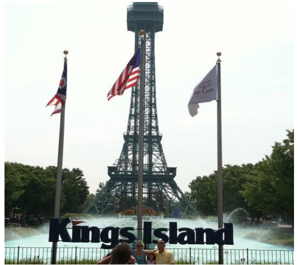
Figure 1 King's Island Park in Ohio

According to the builders' idea, the theme park is a center for family recreation and entertainment, which largely determines the choice of the theme itself. In order to unite people of different ages and, first of all, to attract the adult population, it should be not only entertaining, but also informational and educational. Parks can be created around a wide variety of topics: history, culture, geography, sports, etc. Some of them are devoted entirely to one topic, others touch on different topics, such as King's Island Park in Ohio (it is divided into six themed areas: River City, Wild Animals, International Street) (Fig. 2). Another example is California's Great America Park, a family fun center that houses 100 acres of Hometown Plaza, Yukon Territory, Yankee Harbor, Village Fair, and New Orleans.