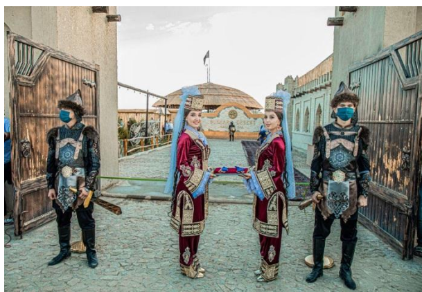
Figure 5 . Bukhara Desert Oasis & Spa

In particular, in Bukhara, in the Ark, an episode of the reception of foreign ambassadors by the emir was staged. (Fig. 4) This production reflects the actions that took place here a little more than a century ago! But this is not enough, the idea must be developed. And the creation of theme parks should be one of the ways to achieve this goal. In the capital of Uzbekistan, you can visit the Victory Park, the Alley of Writers or the Ecopark, in the Bukhara region, ride camels or horses in the new tourist cluster "Bukhara Desert Oasis & Spa" or take a walk through the huge park "Valley of Legends" in Namangan. (Fig. 5-6-7).