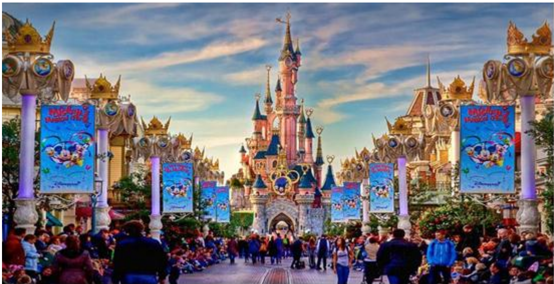
Figure 1. AMUSEMENT PARK "DISNEYLAND" IN ANAHEIM

The basis of the amusement park is a fascinating theme. It manifests itself in objects, attractions and various performances. In accordance with the theme, buildings, landscapes, landscaping, small architectural forms are being developed. The visitor wants to see extraordinary nature in such a park, panoramas different from the usual views of the city, corresponding to his imagination. Therefore, one should not adhere to strict rules; when creating such parks, fantasy and unusualness should be used. The most popular topic today is fantasy. Books, games, films are dedicated to her. It is popular due to the ability to escape from reality and get into another world that is not limited by frames.