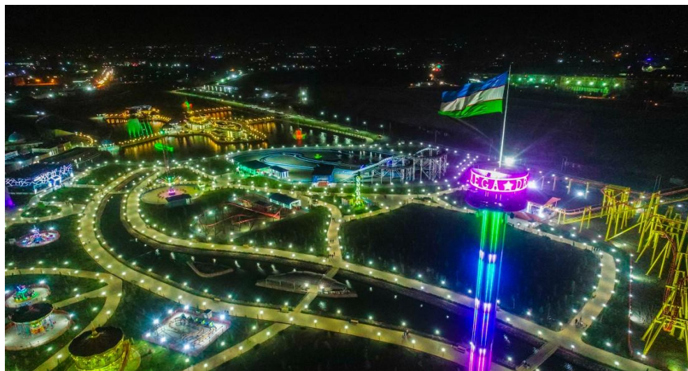
Figure 7 . Fergana. Valley of legends