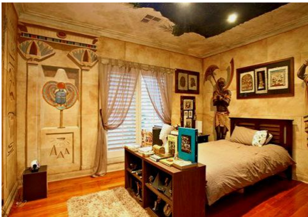
Modern bedroom interior in Egyptian style

By the Bronze Age, the Egyptians created the first appearance of a modern analogue. The use of beds was discontinued, and the use of ropes or leather straps continued. Ordinary people slept on simple low-height beds made of stone and wooden materials.