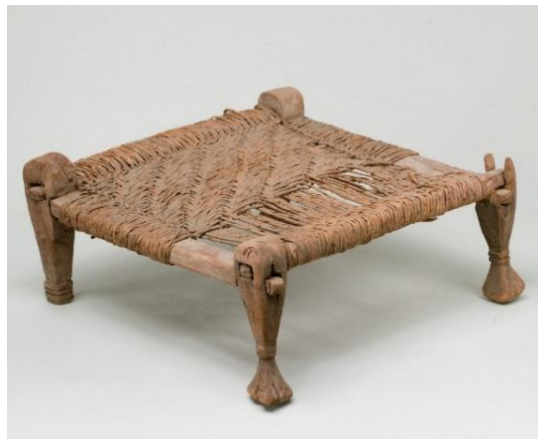
Tutankhamun's bed ancient chair