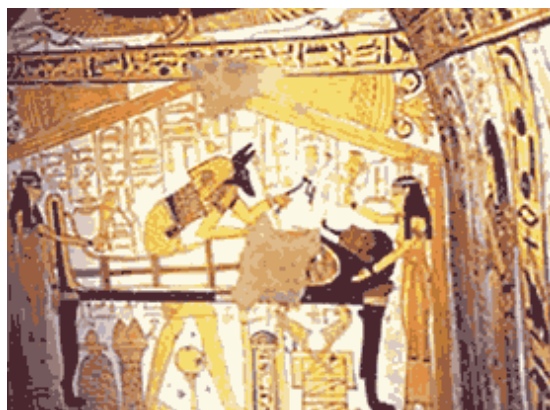
Tutankhamun's bed Tutankhamun's burial chamber (1336-1327 BC) (1279-1212 BC)