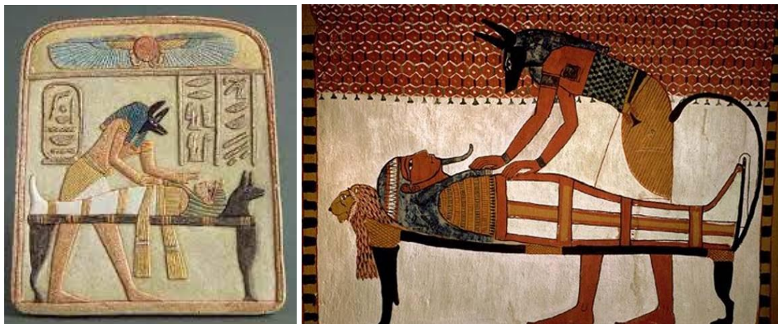
The process of embalming the pharaohs

The people of Egypt were the first in the world to create monumental stone architecture, distinguished by its realism, sculpture, artistic crafts. Egyptian art was new and a great step forward after primitive art 3 .