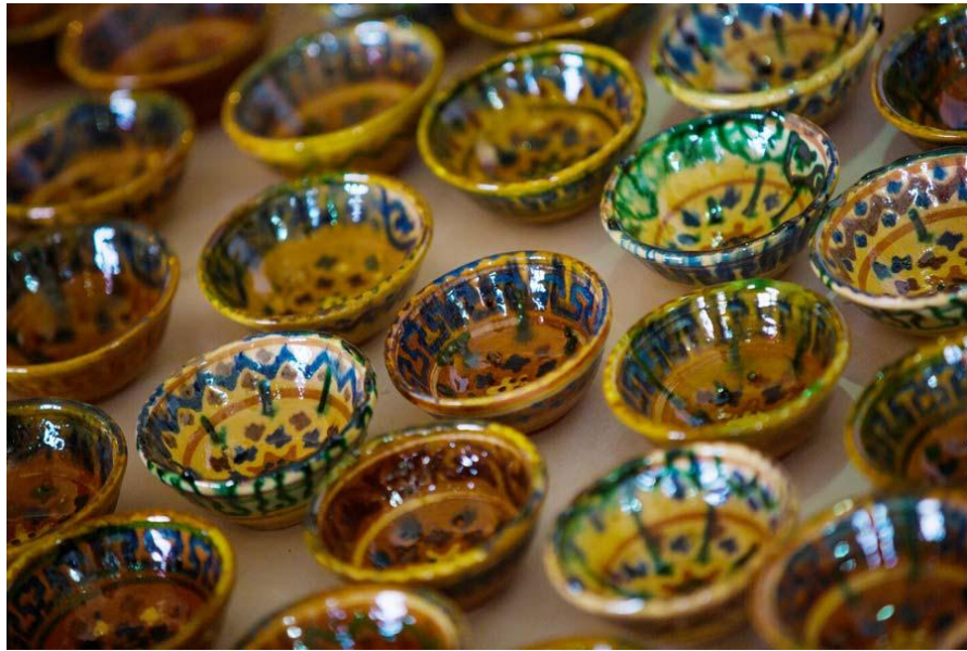
Photo 2. Gijduvan ceramics

Independence and state sovereignty have become important reforming factors of the new social structure, the worldview of the nation, its culture and art. The symbiosis of national and universal values was proclaimed as the main value guideline of the new cultural policy... they gave a peculiarity to the creative search in the contemporary art of Uzbekistan. (2.p 348).