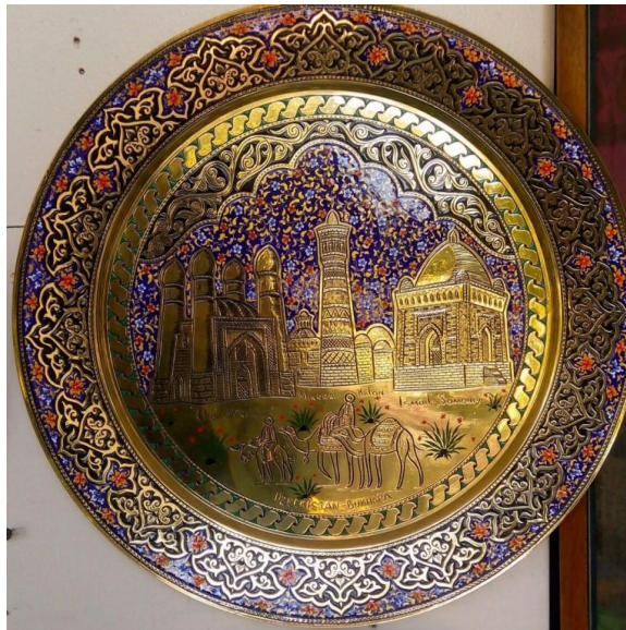
Photo 3. Bukhara coinage

Independence and state sovereignty have become important reforming factors of the new social structure, the worldview of the nation, its culture and art. The symbiosis of national and universal values was proclaimed as the main value guideline of the new cultural policy... they gave a peculiarity to the creative search in the contemporary art of Uzbekistan. (2.p 348).