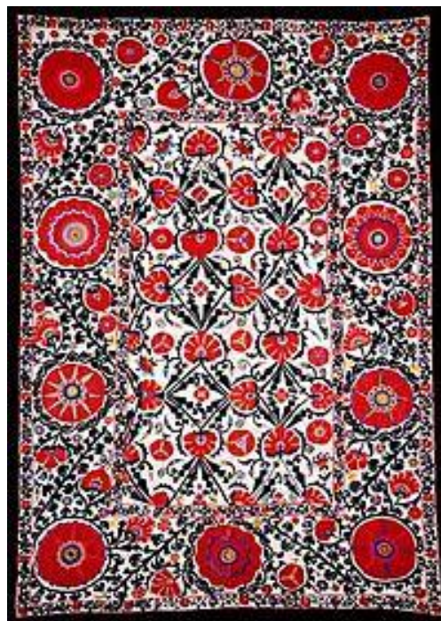
Photo1. Traditional Bukhara suzaneh

Independence of Uzbekistan opened a new bright page in the history of artistic culture. Radical reforms in various directions and spheres of art were implemented, which opened up wide opportunities for creativity.