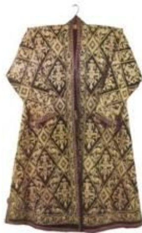
Photo 4. Gold embroidery art of Bukhara

Such types of Bukhara oasis crafts as copper-mining, jewelry, ceramics, artistic embroidery, golden embroidery, wood-carving and painting on wood and ganch with their inherent only artistic features, style, original composition, ornamental motives and techniques have won fame as the ancient centers of Bukhara crafts.